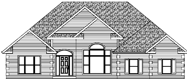
Illustration: Your House Plans